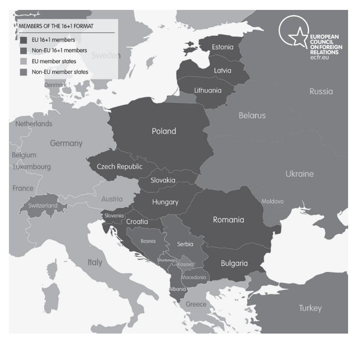
Figure 1: 16+1 Format