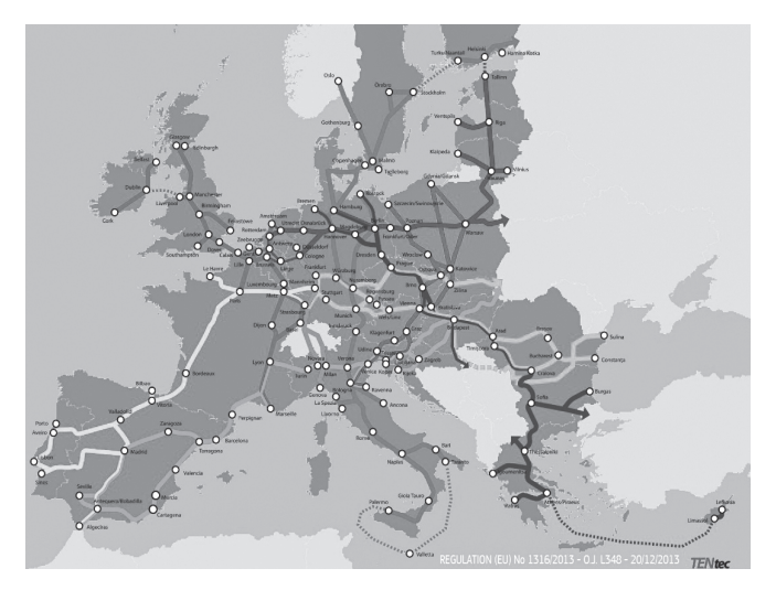
Figure 2: The Trans-European Transport Network (TEN-T)

government. Potentially, then, the whole project will cost around 950 billion forints ($3.7 billion). "Is it beneficial for Hungary to construct this railway with Chinese help? It seems that the project is more ideal for China than for Hungary." However, The pro-BRI scholars focus on the larger picture of geo-political effect of the project. "The Hungary-Serbia Train Project in the cooperation of China-Central Eastern Europe, is precisely the important project of pan-European Communication Corridor, and also one of the ten projects which motivate the whole of Europe from west to east, and from south to north." Remaining debatable, China CEEC cooperation will still be the hot spot of exploring the nature of BRI and the rise of China in the global world.